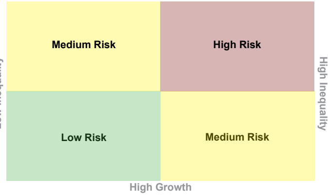
Figure 4: Dynamics of Outcomes Low Growth

The delivery by state institutions of essential public services such as education, health, transport, and welfare can widely influence people's sense of economic security and insecurity. These public services help to ensure that the most vulnerable groups such as the disabled, urban poor, elderly, rural communities and the war affected are not marginalised. In addition to these, various policies of the state pertaining to taxation, subsidies and regulation are perceived as improving or impeding economic justice and thereby affect the public response to the state.