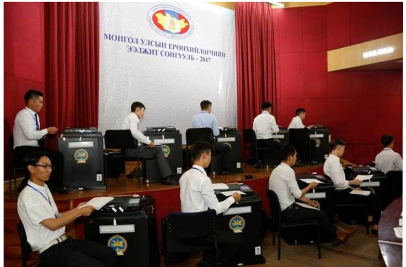
Staff prepare ballot boxes ahead of Mongolia’s presidential election.