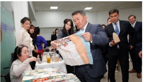
President Khaltmaagiin Battulga visits the Women's Business Center on May 14.

With half of Mongolia's population living in Ulaanbaatar and competing for essential infrastructure like water and electricity, starting a business here and keeping it running is hard, even more so for women entrepreneurs. Mongolia's first-ever <u>Women's Business Center (WBC) and Incubator Project</u>, funded by the <u>Korea International Cooperation Agency (KOICA)</u> and The Asia Foundation's <u>Lotus Circle</u>, supports a growing number of women business owners, particularly single mothers and those with disabilities or from low-income groups, by providing an <u>enabling environment of high-quality business support services</u>. As the most active network of women entrepreneurs in Ulaanbaatar, the WBC is helping women clients create employment opportunities for other women, shift from informal