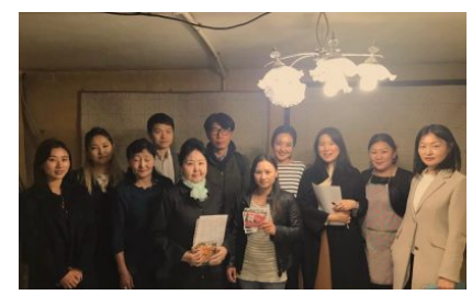
KOICA and SOLUTEK at the Women's Business Center.

Despite making significant improvements in gender equality and having a "reverse gender gap" in tertiary education, women in Mongolia only occupy a small number of top management positions in the public and private sectors. Just 1.4 percent of women take degrees in information and communications technology (ICT) compared to 5.4 percent of men, and while sex-disaggregated statistics on ICT employment is lacking in Mongolia, we can assume that the number of women who pursue a career in ICT are fewer than those who graduate. To bridge this gap between women and ICT in Mongolia, The Asia Foundation is working with Korean IT company SOLUTEK Systems, Inc., and the Korea International Cooperation Agency (KOICA) to integrate ICT into the second phase of its successful Women's Business Center and Incubator (WBC) project. Read more about the Asia Foundation's programs in Mongolia, Korea.