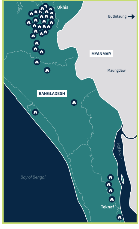
Map: Rohingya refugee camps along the Bangladesh/Myanmar border

Yet despite support from many local CSOs, elements within the host community have raised concerns about the potential for the localization effort to increase self-determination amongst refugees. They worry that this could open the door to their long-term assimilation. Bangladeshi citizens are greatly outnumbered by refugees, and cross-border criminal activity involving both Rohingya and locals, particularly drug smuggling and human trafficking, remains conspicuous. These concerns, along with negative perceptions and stereotypes about refugees, fuel fears about their long-term tenure in Bangladesh.