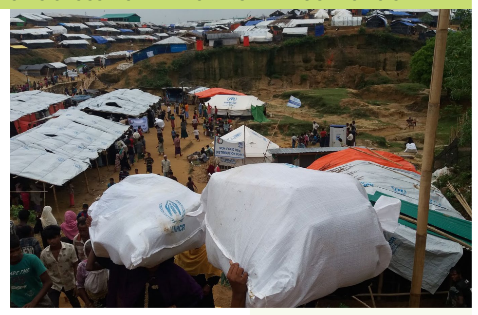
Image: Humanitarian aid distribution in the crowded Rohingya refugee camp, Cox's Bazar, Bangladesh.

Refugees in Bangladesh await sustainable solutions through the ICC, ICJ and other international justice mechanisms. Yet while recent progress brings hope, international accountability is expected to take years, and will likely be insufficient to resolve the domestic political factors at the root of the crisis. Refugees as well as host communities are asking for humanitarian assistance to be delivered in a way that engenders their own sense of agency and resilience. To achieve this, there is growing focus on addressing the Rohingya crisis through localized rather than international action.