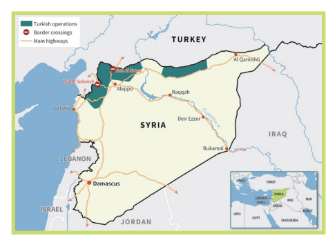
Map: Turkish-controlled areas along the Syria/Turkey border