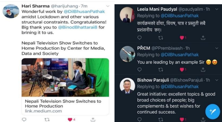
Figure 3: Responses of Viewers on "Tough Talk Program"