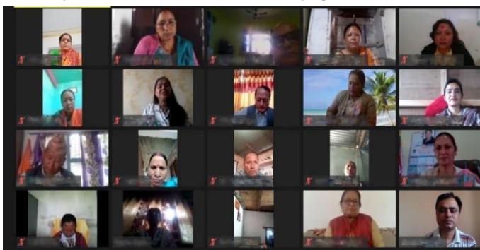
Figure 1: Participants of Capacity building Support for Judicial Committee Members and Elected Women Leaders Event

The program-supported multi-stakeholder dialogue process continued to provide critical support to the local governments in responding to the Covid-19 pandemic crisis. With support from the program, Dialogue Forums, a representative body of diverse local stakeholders provided support and advice to the local governments in managing 66 local issues. As the impact of the COVID-19 pandemic is still rising in Nepal, support of Dialogue Forums will be even more crucial. Forum members also successfully addressed 79 contested issues related to service delivery; Covid-19 relief and recovery; governance and similar.