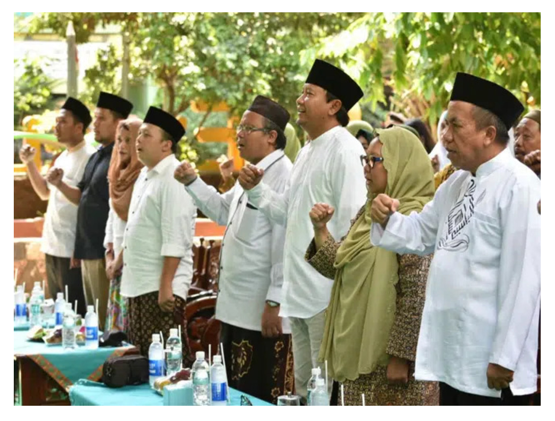
Participants speaking out against sectarian narratives and identity politics.

<u>Myanmar's</u> relapse into military rule is a recent and catastrophic example of the trend of democratic decline throughout Asia. In this context, The Foundation is working to foster democratic resilience through Reclaiming Civic Space to Promote Democratic Resilience, a pilot program in Indonesia. The initiative focuses on espousing local political participation to empower citizens to shape a political agenda that is centered on shared needs and interests to ward off sectarian narratives and polarization.