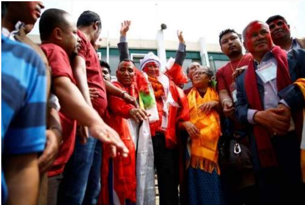
Bidya Sundar Shakya after being elected mayor of Kathmandu in the first phase of Nepal's local elections in 2017.

forward-looking action to protect the safety and integrity of the political process. Learn more about our work to strengthen governance and our Nepal office.