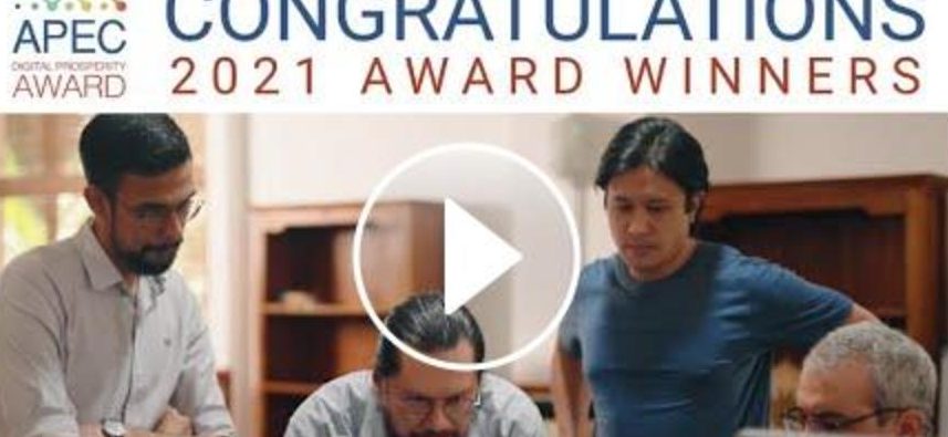
APEC TRAVELLER APP TEAM

The APEC Digital Prosperity Award recognizes innovative digital products or applications that have the potential to increase prosperity and inclusive growth. This year's winner, the APEC Traveler App would make it possible for travelers to confirm their COVID-19 vaccination status at APEC country border crossing and immigration checkpoints using a QR code. This innovative App would help support the tourism sector, which is essential for economic recovery in Asia. Learn more about the Foundation's work with technology and development .