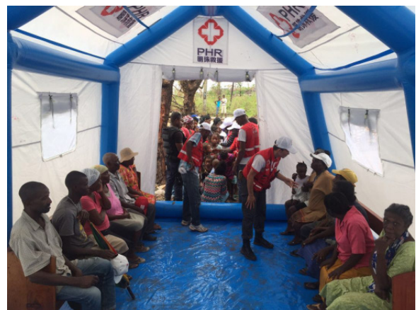
Members of a Chinese disaster relief team work near Jeremie, Haiti.