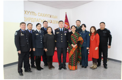
Participants at the recent training session on responding to domestic violence.

This is a particularly momentous step for Mongolian women, who, despite the country's relatively high score on gender equity measurements, experience high levels of domestic violence. The change demonstrates the government's commitment to combating domestic violence, protecting domestic violence victims, and holding perpetrators accountable. However, barriers that impede the effective implementation of the law remain. Read more from Ashleigh Griffiths, project officer for The Asia Foundation in Mongolia, here .