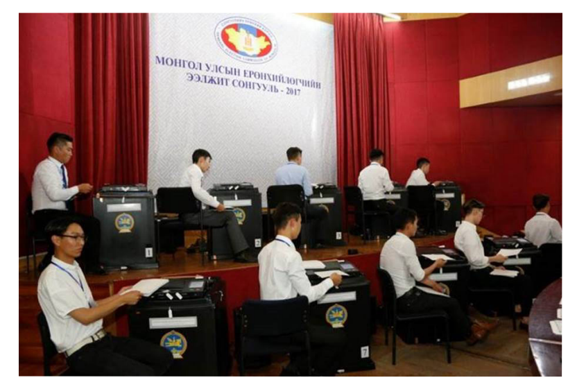
Staff prepare ballot boxes ahead of Mongolia's presidential election.