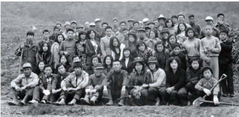
Students from Chonju Teachers College and villagers participate in a rural community development project (1974).

The Asia Foundation initiated a Seoul Sabbatical program with Chonnam National University in 1972, eventually expanding the program to include Chungnam National, Cheju National, and Chonbuk National Universities . Under this program, provincial professors gained specialized training by working with fellow scholars in Seoul, many of whom possessed overseas doctoral degrees and kept in close touch with developments in their respective fields. Because it offered effective incentives for better staff research and teaching, the program became a regular initiative of the Ministry of Education.