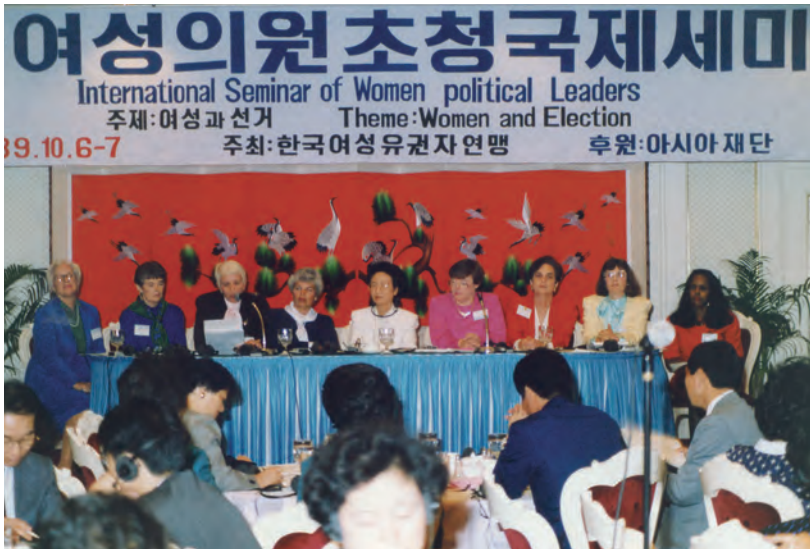
The Korean League of Women Voters brought to Korea eight members of the Women's Network of the National Conference of State Legislatures (U.S.) to promote understanding and cooperation in the area of women's political participation (1989).