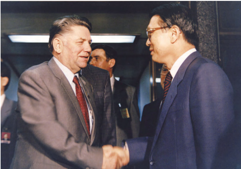
Soviet Prosecutor General Alexander Sukharev (left) and Korean Attorney General Kim Ki-choon (right) at the Second Conference of Attorneys General of Asia and the Pacific, in Seoul (1990).

The Asia Foundation supported the Supreme Public Prosecutors' Office (SPPO), then headed by Prosecutor General Kim Ki-choon, in hosting the Second Conference of Attorneys General of Asia and the Pacific in 1990. Held in Seoul, the conference brought together 80 participants from 20 countries to (1) strengthen international cooperation among the offices of the attorneys general; (2) provide a forum for the exchange of ideas, information, and legal materials on the role and responsibilities of the attorney general; and (3) promote ties of friendship and professional exchange among the attorneys general of the region.