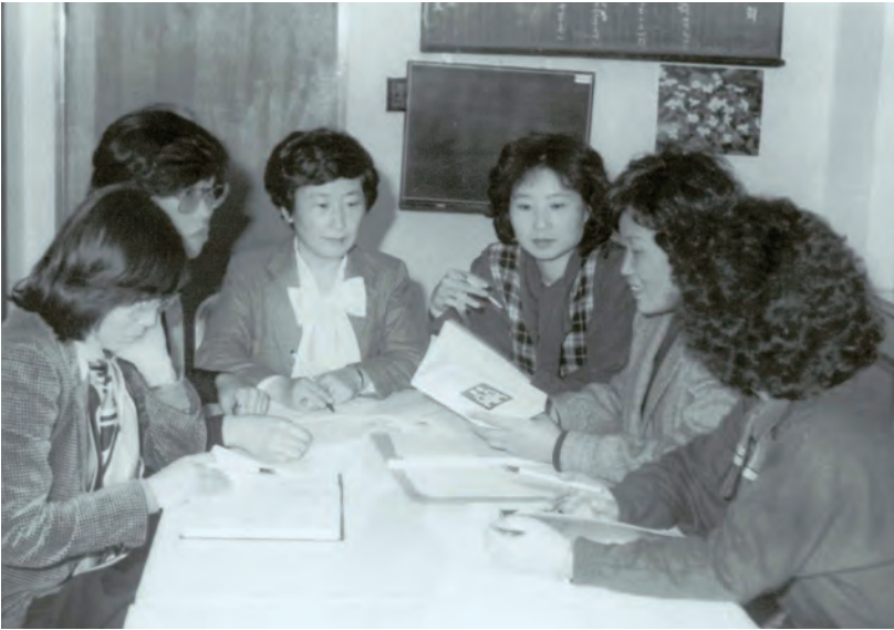
Counseling staff of the Korea Legal Aid Center for Family Relations review their popular legal guide, What Can I Do? , published with a grant from The Asia Foundation (1983).

For several years, from the early 1970s, The Asia Foundation Korea Office engaged in a series of activities under the rubric of Special Problem-Oriented Programs (SPOPs) with grants from the U.S. Agency for International Development (USAID) and private funding sources. The SPOPs set out to improve national living standards by focusing on factors vital to the population's domestic well-being. The SPOPs in Korea focused on three specific areas: population and family planning, food and nutrition, and healthcare delivery services.