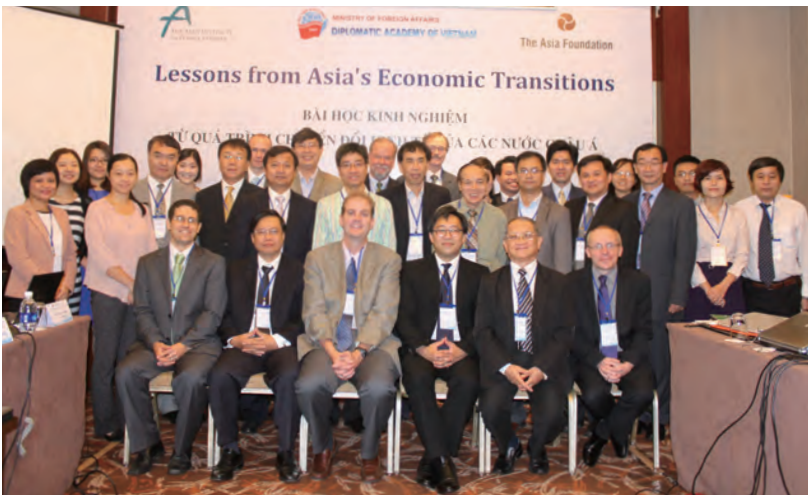
Regional Dialogue on Lessons from Asia's Economic Transitions for North Korea, September 5-6, 2013, Vietnam

The Asia Foundation and the Asan Institute for Policy Studies conducted a yearlong research project to explore lessons that might be relevant to North Korea if it were to choose the path toward a more open and prosperous economy. The first seminar was held in Ulaanbaatar, July 22–23, 2013, and focused on the experiences and lessons of Northeast Asian economies, particularly Mongolia and China. The seminar was hosted by the Mongolian Development Research Center and included participants from China, Mongolia, South Korea, and the United States. A second seminar was held in Hanoi, September 5–6, hosted by the Diplomatic Academy of Vietnam. Development specialists and government officials from seven countries (China, Laos, Myanmar, Vietnam, Taiwan, South Korea, and the United States) made presentations and shared perspectives on lessons from transitional economies in Southeast Asia. Selected papers from the seminar were published by the Asan Institute. The project papers were made available to North Korean counterparts in a separate meeting.