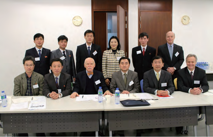
Workshop on International Trade Law for DPRK officials, December 2013, Hong Kong