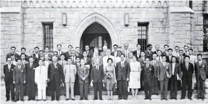
Participants of the International Conference on Modernization in Asia held at Korea University (1965).