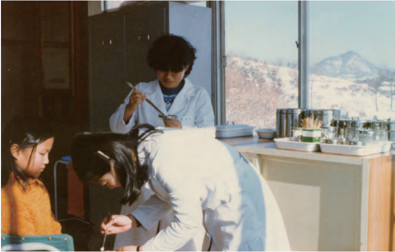
Primary health-care services provided by Cheongju Nurses' Training College (1977).

the studies that gave vital information to those concerned with the development of Korea's health-care system in rural areas. The Institute for Industrial and Social Development, Kyungpook National University , carried out research to document the health conditions, attitudes, and behaviors of small-scale, "sweatshop" industries in the Taegu area not covered by mandatory government health regulations. A research report was published in an effort to improve health standards in small industries, and with subcontractors and other operators not fully registered with the government in the rapidly industrializing Taegu area.