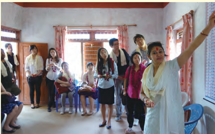
Study trip to Nepal on "Development Cooperation in Post-conflict States," April 27–May 5, 2013