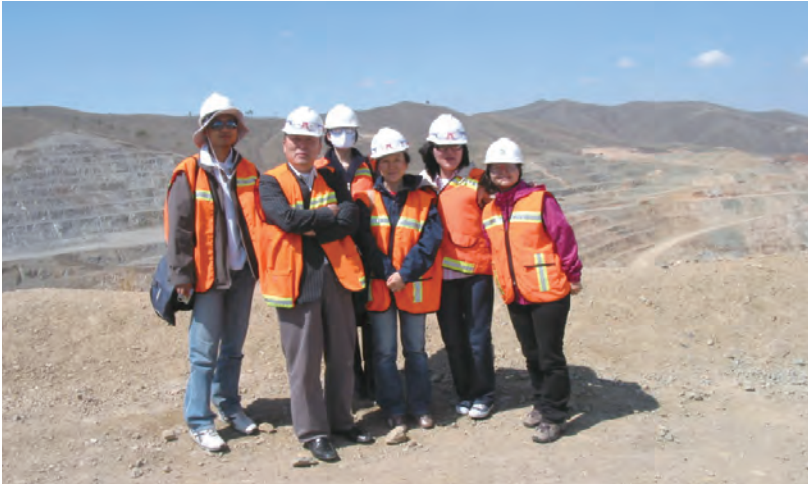
Study trip to Mongolia on "Environment and Development," May 11–17, 2008