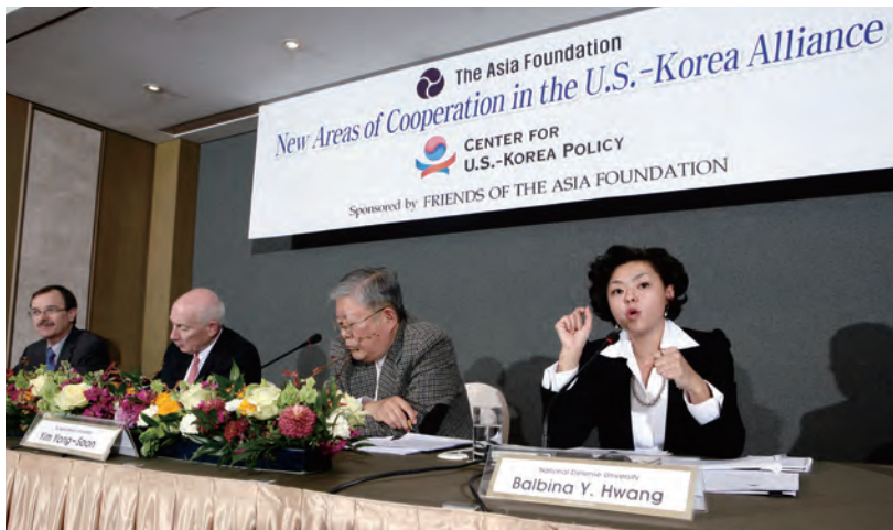
U.S.-Korea Dialogue on Strategies for Effective Development Cooperation, October 17-18, 2011, Seoul

Participants including representatives of KOICA and USAID, plus U.S. and Korean development experts, exchanged analysis and lessons on best practices in international development cooperation.