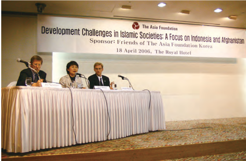
Public forum on "Development Challenges in Islamic Societies," focusing on Indonesia and Afghanistan, April 18, 2006, Seoul