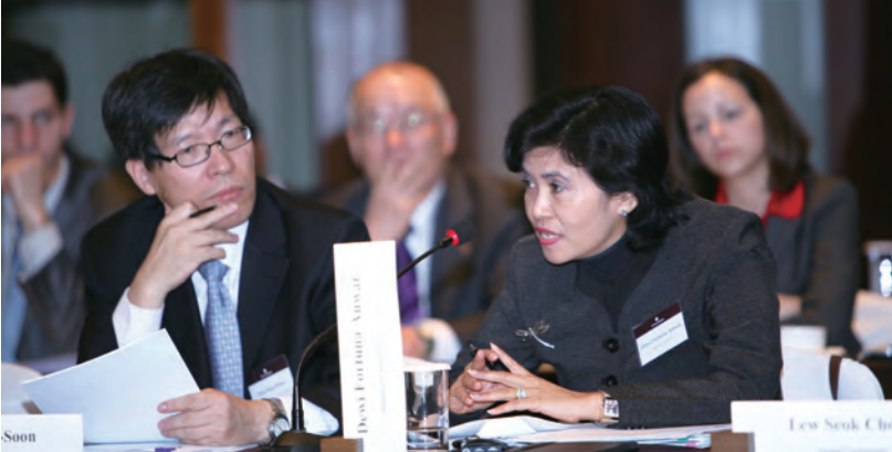
International Dialogue on Southeast Asia and Korea: Expanding Influence and Relations, March 19-21, 2008, Seoul