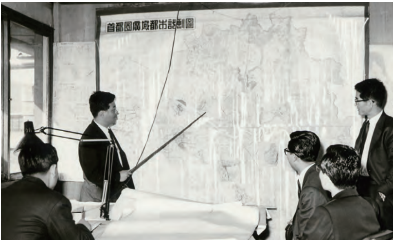
Discussing urban planning at the Ministry of Construction's Housing, Urban, and Regional Planning Institute (1965).

The Mapo program heralded the era of apartments in South Korea, bringing revolutionary change to the urban centers of the country, not only in physical appearance, but also in lifestyle. The apartments brought with them structures and modern facilities that were safer, more comfortable, and more hygienic. Many traditional houses lacked hot or running water and had primitive facilities. Significantly, the extended outgrowth of The Asia Foundation's urban development assistance led to the present-day accommodation of nearly 14 million people within the mountainous terrain surrounding the capital city of Seoul.