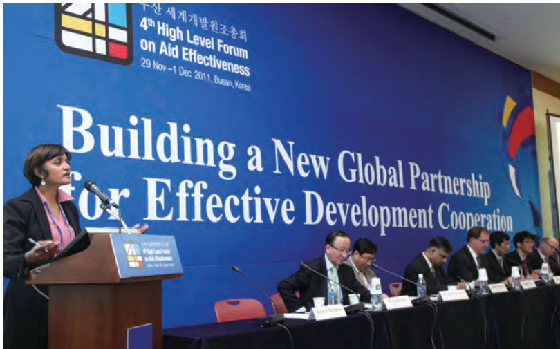
The Asia Foundation hosted two seminars at the Fourth High Level Forum on Aid Effectiveness., November 29, 2011, Busan