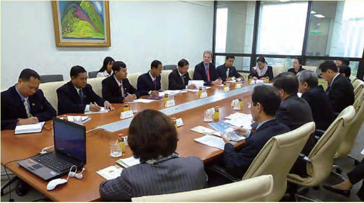
Myanmar parliamentary delegation, Korean study trip on “Structures and Functions of Parliamentary Organization,” April 5–10, 2014