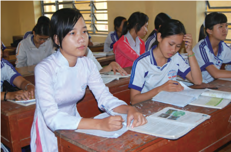
FOTAF supports Vietnamese girls' scholarship program (2009–)