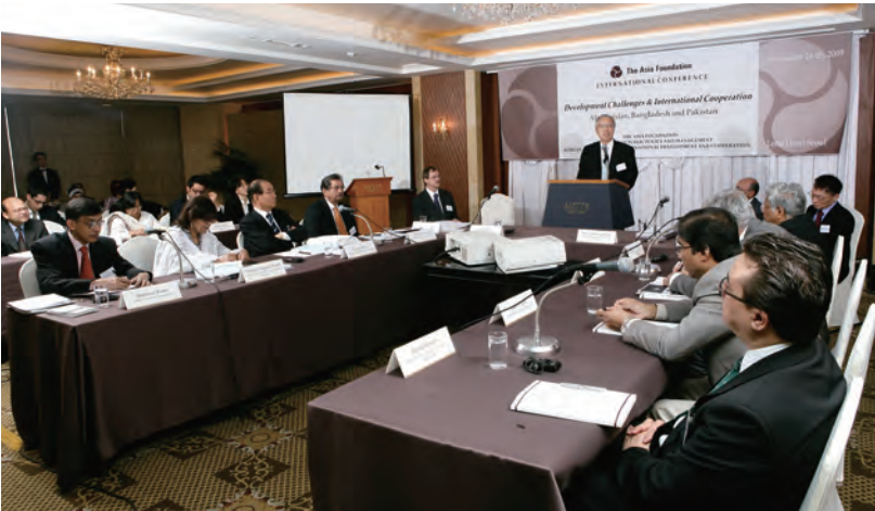
International Conference on Development Challenges in Afghanistan, Bangladesh, and Pakistan, November 24–25, 2009, Seoul

The International Development Cooperation Capacity Building Program also included a series of international conferences in Korea focusing on current topics in development cooperation. The Foundation’s capacity to organize topical gatherings with the participation of high-caliber development experts from around the region and beyond had been ably demonstrated in the earlier series of conferences. The partnership with the KDI School enabled the Foundation to continue this series. One or two major conferences were held each year, some with additional funding support from FOTAF or other sources. Presenters at the conferences included experts from around the region,