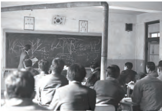
Training farmers in grafting skills under the Farmers Education Project of Yesan Agricultural Junior College (1974).

Some twenty grants were made in 1976, enabling universities and colleges to extend their educational services to rural areas. Taegu Teachers College hosted a gathering with sister colleges to develop handicraft programs to generate supplemental income for farmers during the long, inclement winters. Participating professors provided necessary know-how in commercial handicrafts to abet farmers in making productive use of the off-season. Cheju National University worked to improve the productivity and income of farmers working on marginal land. Kyungsang College , at the time an institution specializing in agricultural education, proved to be a most effective programming vehicle for providing technical extension services to farmers, through the establishment of a Farmers Technical Guidance Center.