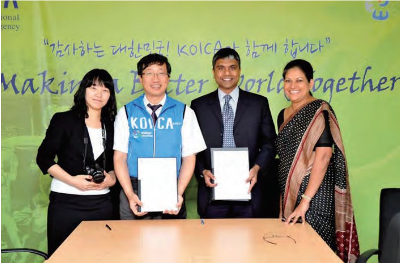
MOU signing for KOICA's grant to The Asia Foundation Sri Lanka, December 2011

organization to local office of an international NGO, through which new lines of KOICA funding could be channeled. This meant a more solid basis for the Foundation to receive Korean government funding. However, by making the Korea Office the middleman in the funding process, it created much more work for the office, for which there was no compensation in the Korean grants.