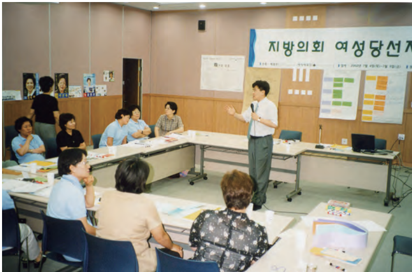
A workshop conducted by the Sejong Leadership Institute for a group of newly elected local councilwomen (2002).

The National Election Commission Electoral Training Institute in 2001 partnered with The Asia Foundation on a training program for women candidates for the 2002 local elections. Four, three-day training sessions were conducted nationwide for a total of 120 women candidate-trainees. A questionnaire administered at the end of the program revealed that 112 of the trainees, 81.8 percent, were determined to run in the upcoming local elections.