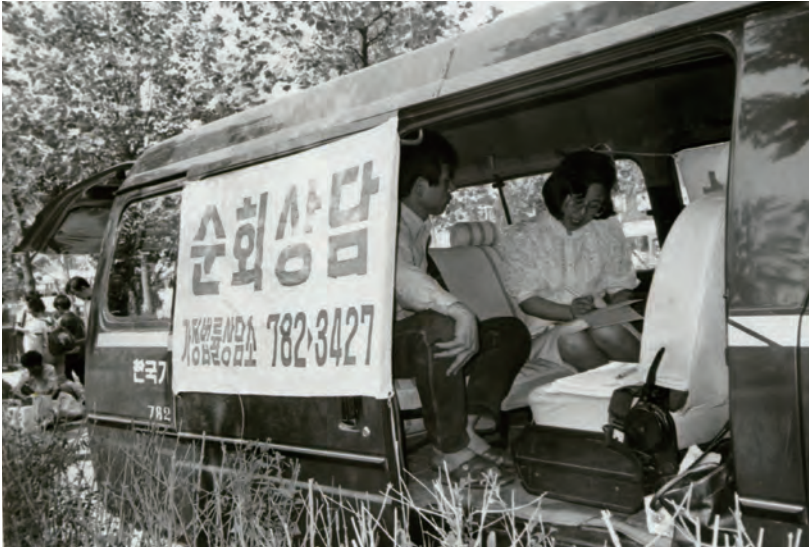
Mobile legal-aid counseling services provided by the Korea Legal Aid Center for Family Relations (1982).