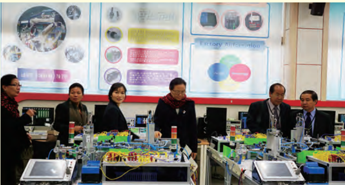
Lao Ministry of Education, Korean study trip on “Education and Human Resource Development,” October 26–31, 2015

(Funded by DFID Programme Partnership Arrangements, Sri Lanka)