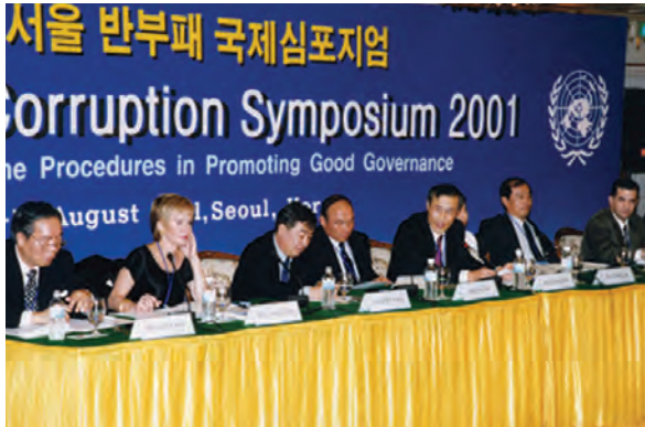
Guest speakers at the Seoul Anti-Corruption Symposium 2001, organized by the Seoul Metropolitan Government under the cosponsorship of the United Nations and The Asia Foundation.

the administrative legal systems in East Asia were making strong progress in reform efforts, few attempts had been made to compare concurrent studies on administrative law in the region. The Chinese delegation agreed to host the third meeting in China in 1999.