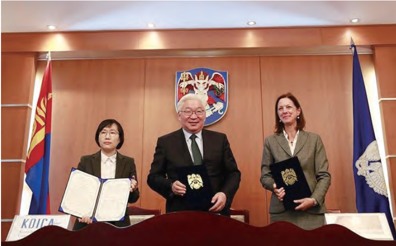
MOU signing by KOICA, the City of Ulaanbaatar, and The Asia Foundation for the Women's Business Center and Incubator, January 2016