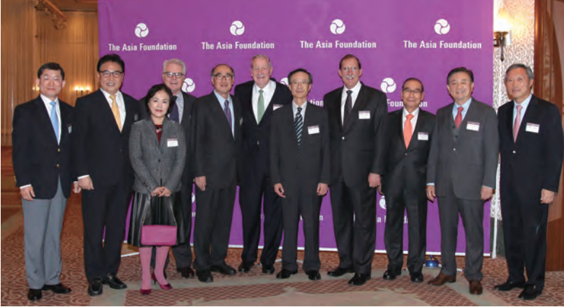
FOTAF board members with Foundation leadership at The Asia Foundation Korea's 60th anniversary, November 2014, Seoul

FOTAF has two forms of membership, individual and corporate. Individuals contribute an annual membership fee, receive frequent updates on Foundation programs, and participate in public events and closed-door, special forums. Corporate donors make an annual contribution of 10 million won (about US $10,000) toward support of Foundation programs and are recognized at all public events and in published and online documentation. This individual and corporate support has given the Korea Office the flexibility to organize public forums and conferences in response to evolving circumstances. The Board of Directors of FOTAF meets quarterly to review program and fundraising progress and provide input on program planning. Particular members of the board have played critical roles in providing linkages and endorsements that have led to the successful launch and funding of many of the new programs described in this chapter.