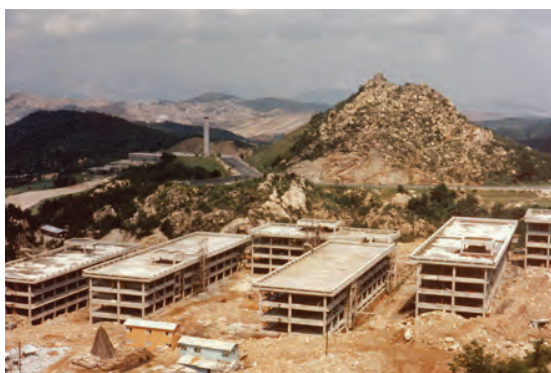
A scene of the early stage of construction of the Seoul National University campus at Kwanaksan on the southern outskirts of Seoul (1971).