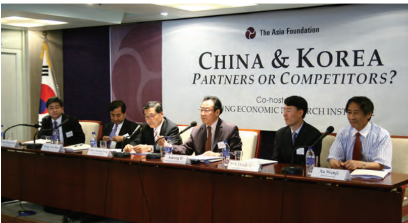
Public forum on Korea-China relations, June 13, 2006, Seoul

Throughout this period, the Korea Office continued to sponsor various activities to foster dialogue on critical issues among regional actors in Northeast Asia and the subregions of Asia. Many of these activities are listed below. In 2012, the Foundation formalized this role by giving the Korea Office a leadership role in working with other Foundation offices and actors to organize regional programs for addressing critical political, economic, and social issues. From the beginning, it was envisioned that the participation of North Korea in these regional programs would be a priority. However, given the difficult political climate, it has not been possible to arrange North Korea's participation.