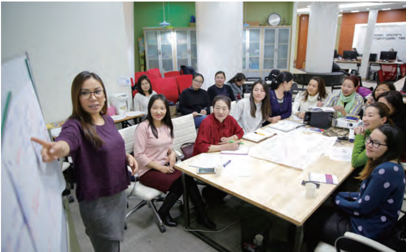
KOICA-funded Women's Business Center, Ulaanbaatar

the registration of the Korea Office, from field office of an international NGO to domestic development NGO. This arrangement has created the basis for future funding partnerships with KOICA and other Korean aid agencies. It has also required major changes in the programming, budgeting, and reporting procedures in the Korea Office. Fortunately, the Korea Office's experienced