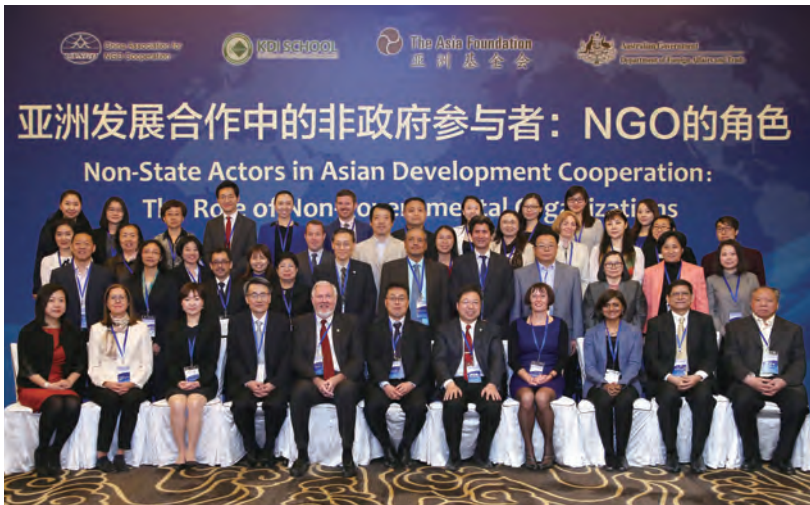
AADC dialogue on "Non-State Actors in Asian Development Cooperation: The Role of NGOs," April 19–20, 2016, Beijing

Seoul: November 24–25, 2016 (authors' workshop)