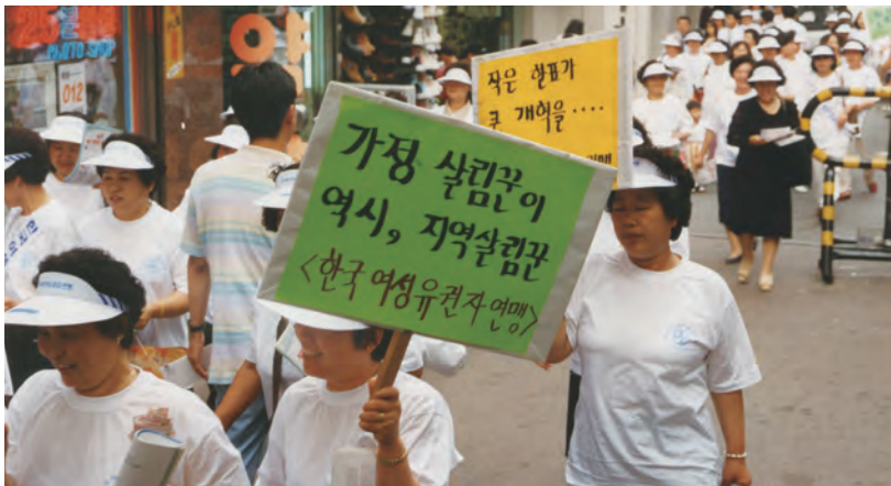
A street campaign for fair elections by members of the Korean League of Women Voters (1992).

Asia Foundation programming in the field of women's participation has been extensive over the past three decades. Aside from its continued assistance to the three major women-focused NGOs in Korea from the 1970s to the present — the Korea Legal Aid Center for Family Relations, the Korea League of Women Voters, and the Center for Korean Women and Politics — the Korea Office also addressed the needs of numerous women's organizations to enhance women's participation in politics and society.