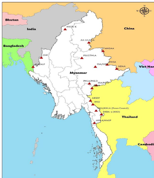
Figure 5-1 | Headquarters of 17 ethnic armed groups in Myanmar along its borders (2019)