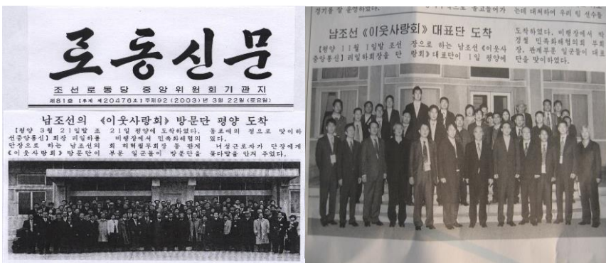
Figure 6-2 Newspaper Photographs of South Korean NGO Workers Visiting North Korea in 2003 and 2006