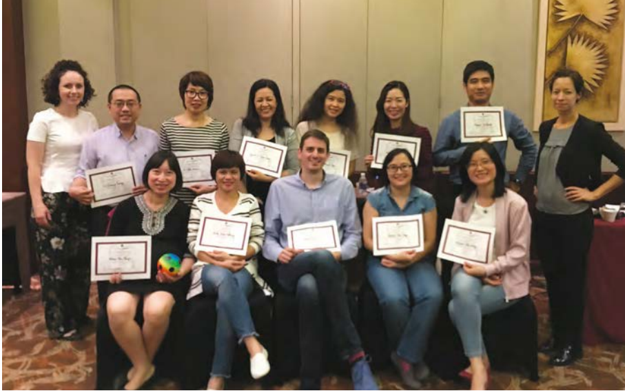
Gender workshop with Asia Foundation staff in Vietnam