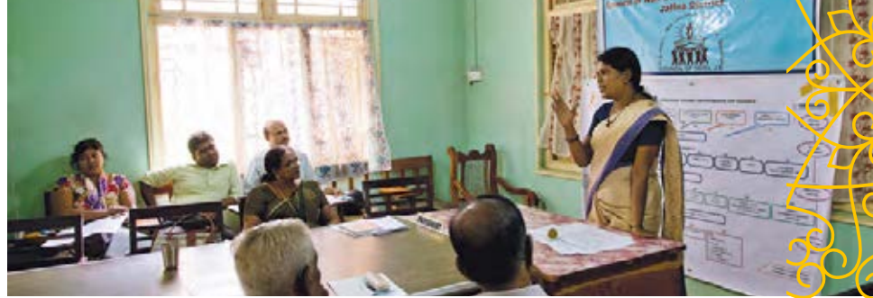
Counselor meeting with Children and Women's Bureau staff in Sri Lanka