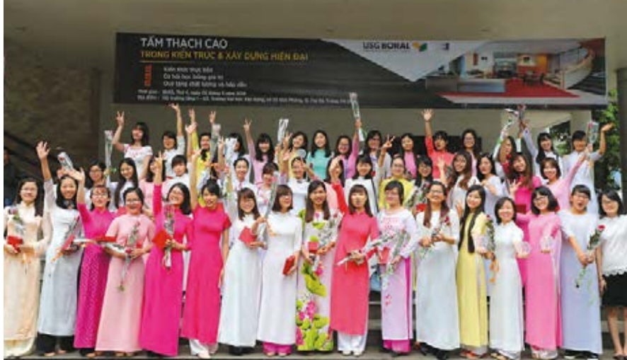
The graduation ceremony of the Merali Scholars' first cohort in Vietnam at the National University of Civil Engineering