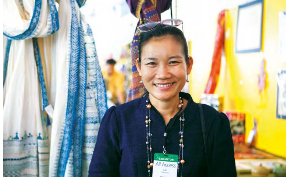
The Santa Fe International Folk Art Market brought Asian women artisans into the global marketplace.