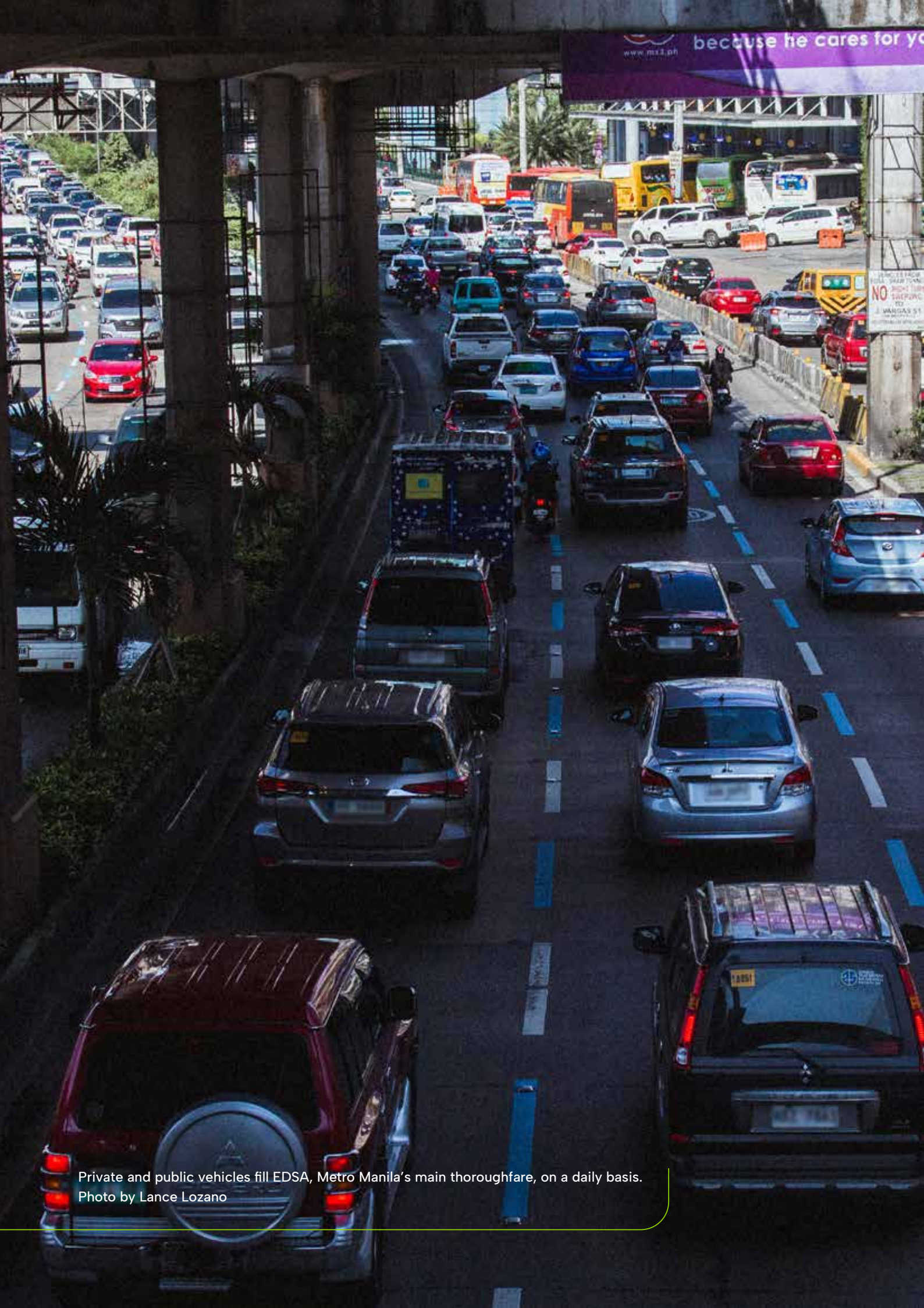
Private and public vehicles fill EDSA, Metro Manila's main thoroughfare, on a daily basis.