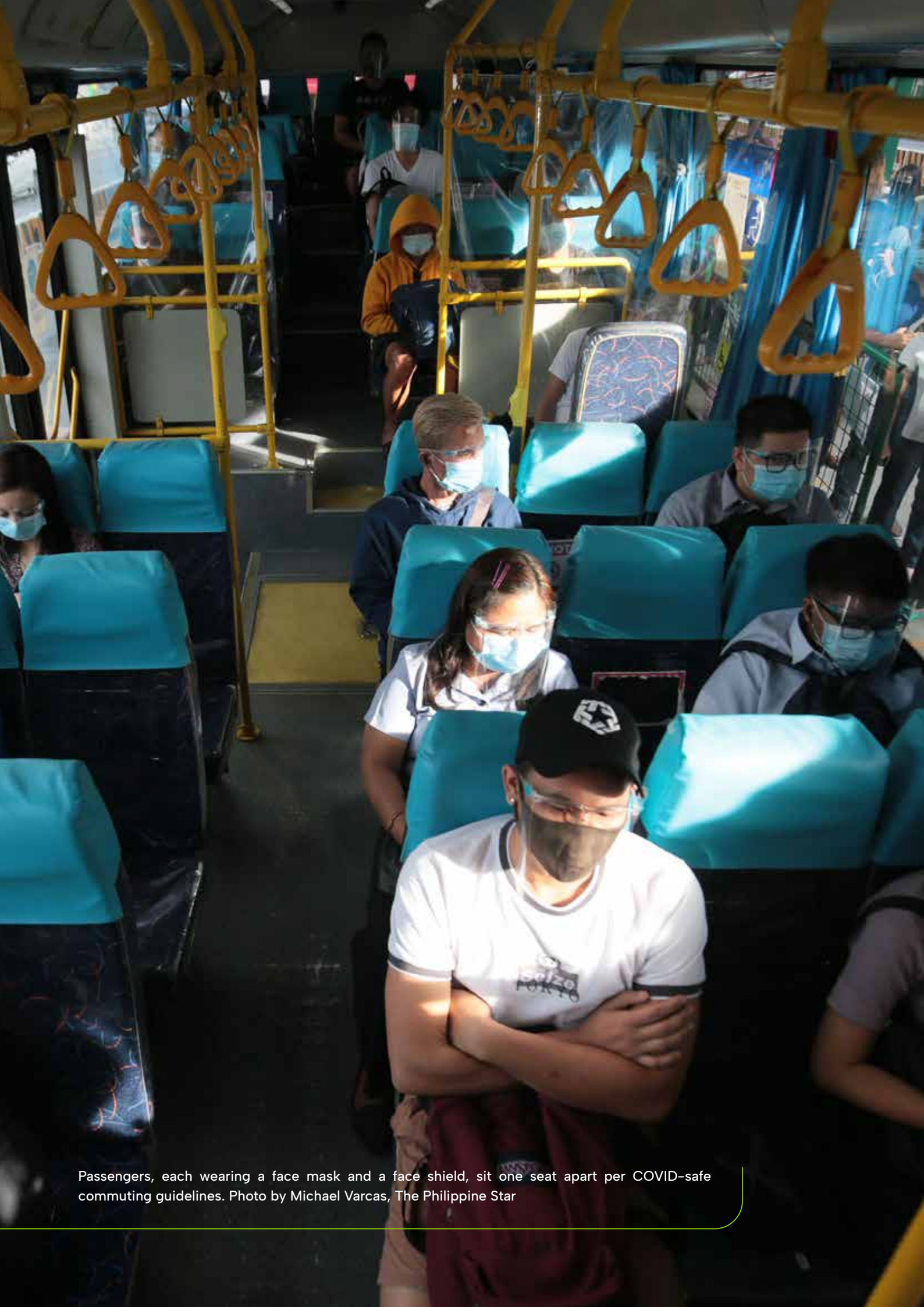
Passengers, each wearing a face mask and a face shield, sit one seat apart per COVID-safe commuting guidelines.