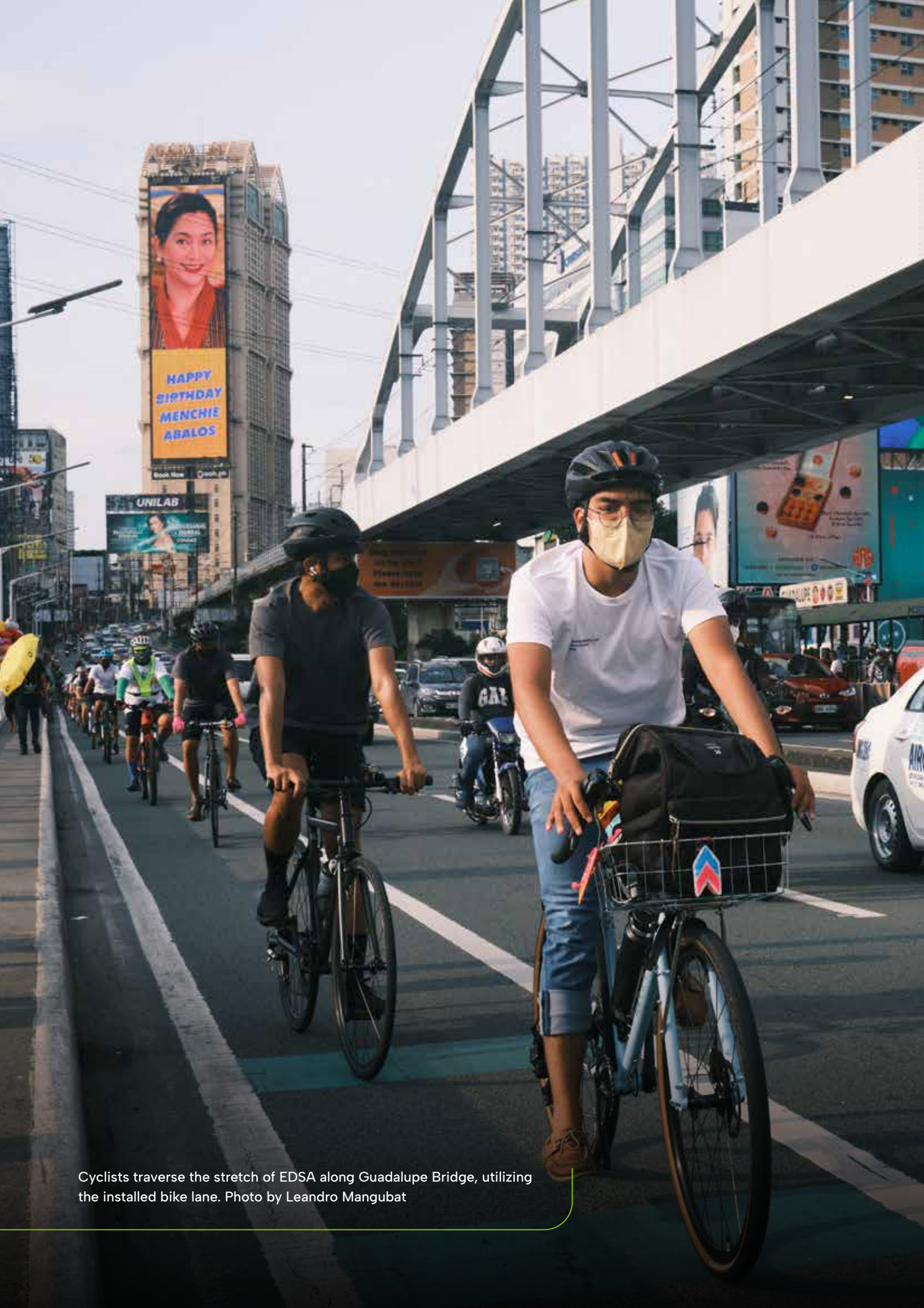
Cyclists traverse the stretch of EDSA along Guadalupe Bridge, utilizing the installed bike lane.