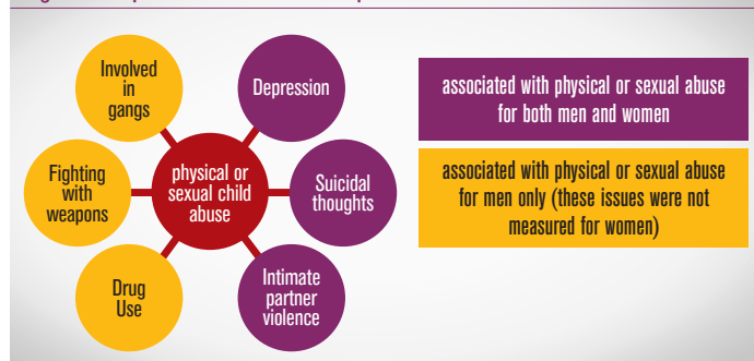
Figure 2: Implications of childhood experiences of abuse for women and men

1 in 2 women and 1 in 3 men reported that, as children, they witnessed their mother being abused.