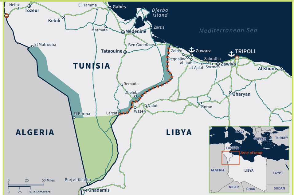
Tunisia's border with Libya

The economic crisis in Tataouine Governorate has aggravated the condition of herders, but other factors have further exacerbated their situation. The first is the tribal land tenure system, under which thirty percent of land is subject to collective tenure and is managed by tribal councils, with each tribe in Tataouine having such a council. The system has created tensions over land ownership among tribes, causing communal disputes over boundaries and the use of these areas, which have disrupted transhumance routes. A second factor is the drastic reduction in the land available for pastoral activities. This is primarily due to desertification and climate change, but also the privatization of communal lands and their purchase by large farms. In 2010, private land ownership in Tataouine Governorate was estimated at 65,710 hectares (around 82 percent) . The remaining land that is owned communally