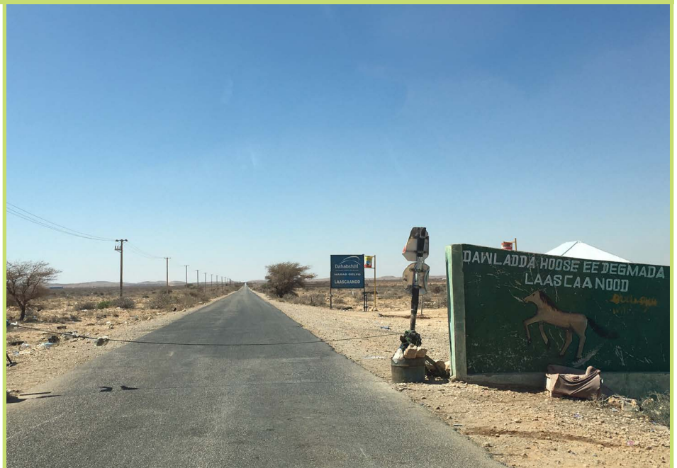
Lasanod checkpoint on the road to Berbera.

First, the contested city of Lasanod , which is located on the border between Somaliland and Puntland and is on an important trade and transport corridor that links supply chains from the Somali coastal ports of Berbera and Bosaso with the Somaliland interior. To profit in this complicated business environment, traders must negotiate multiple tax regimes in the borderlands between Somaliland and Puntland.