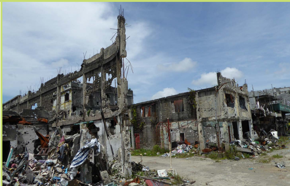
Destroyed buildings in Marawi, Philippines.

At the same time, adversaries occasionally agree to negotiate peace settlements, and some national leaders have carried out political reforms to tackle the root causes of violence. Most prominently the Philippines has made steady progress on its 2014 'Comprehensive Agreement on the Bangsamoro', with the plebiscite and passage of the enabling laws in 2019 and the creation of the Bangsamoro Autonomous Region in Muslim Mindanao the same year. Peace agreements in Nepal and Indonesia also continue to hold even if developmental and conflict challenges remain.