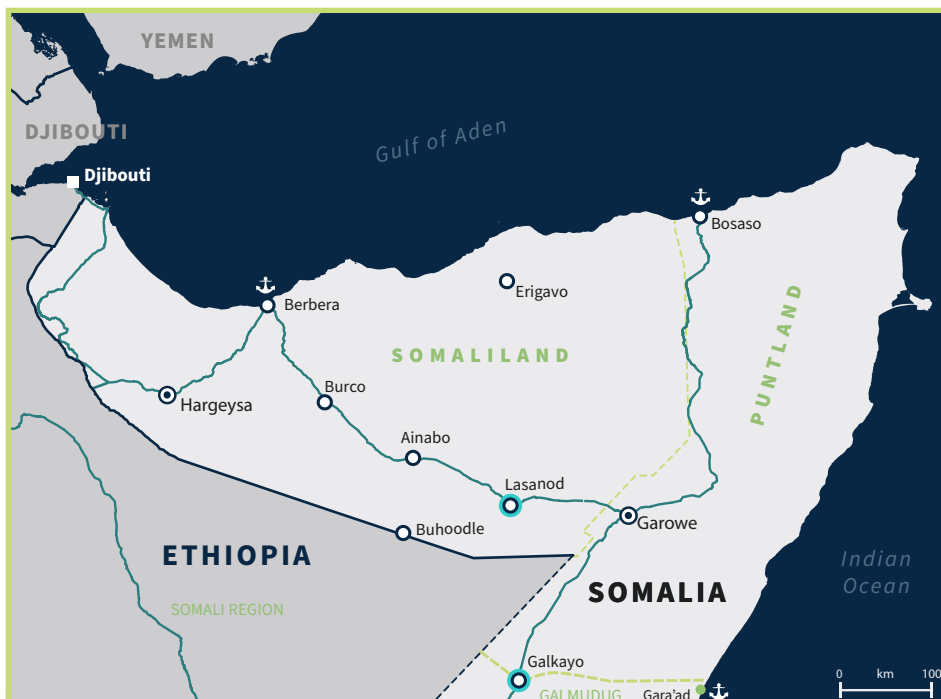
Border regions of Somaliland, Puntland and Ethiopia's Somali Region.

In the Somali territories, borders—which have seen an increase in the number and also the strength of local administration—are sites where state-building can be supported and conflicts, in particular over revenues and trade corridors, can be defused. Building economic cooperation is key to a sustainable political settlement both in Somalia and Somaliland. Therefore, trading borders are sites that warrant increased attention, particularly from those wishing to assist with the development of the economy, security and administration in the Somali-speaking regions.