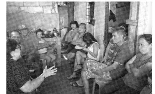
Coalitions for Change held discussions with informal settlers living in danger areas along the Metro Manila waterways.

After a series of initial meetings, CfC established a partnership with the Department of Social Work and Development (DSWD) in April 2014. Discussions were also held with the World Bank who was working on a similar rental housing concept. In May, CfC and DSWD held a workshop to design the rental housing pilot program and policy, and from June to July consultations were held with ISF communities, landlords, and local governments in Pasig, Manila, Caloocan, and San Juan. The results fed into the joint DSWD-CfC technical working group.