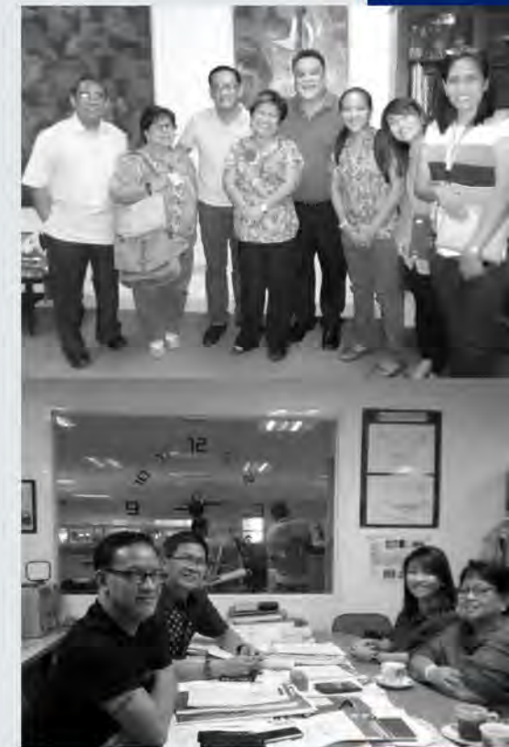
Partners from the DSWD and the local government

While CfC recognizes the importance of the political dimension of reform, technical expertise is an equally important factor. In this activity, the Australian Embassy-supported 'Socio-Economic Profiling' research of the University of the Philippines Planning and Development Research (UP-PLANADES) provided valuable baseline data on ISF to inform the rental housing design.