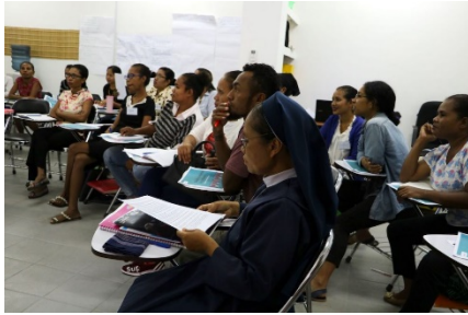
Students attending the Certificate III in Social Services course in Dili.

The Asia Foundation has designed a specialized Certificate III in Social Services course, which has just kicked off its third year of delivery, to support the development of a skilled workforce of social service professionals in Timor-Leste, who have extremely limited training and professional development opportunities. Students complete 100 hours of class over a six-month period on a range of topics including gender equality, LGBTI rights, legal frameworks, disability issues, counselling, case management and self-care, with student alumni from the two previous years now returning as facilitators. The training is the first of its kind in Timor-Leste, created as part of the Australian Government's Nabilan Program ending violence against women, and in collaboration with a local vocational training provider ISAT . Read more about the Foundation's programs in Timor-Leste and empowering women .