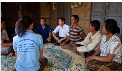
A legal aid clinic in Pakse, in southern Laos.

In Laos, until recently, the formal state has had difficulty bringing the full benefits of the justice system to large parts of the population that live in and around remote villages. The Master Plan on Development of the Rule of Law in Laos toward 2020 was adopted 10 years ago, but bringing formal legal aid and institutional support to vulnerable citizens living in remote areas started much earlier, in 2007, when the Ministry of Justice, the Lao Bar Association (LBA), and The Asia Foundation embarked on a collaboration to develop a national system of legal aid, shepherding three pilot clinics into existence by 2011. The Ministry of Justice now has a total of 7 legal aid offices at the provincial and district level. The adoption of the Prime