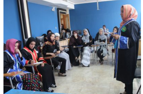
A mock trial for female prosecutors in training.

Female participation in the legal sector has increased dramatically in Afghanistan since the fall of the Taliban regime in 2001, but Afghan society's strict segregation of the sexes, and a shortage of female legal professionals, still makes it difficult for women to seek redress through the formal justice sector, where they face shame, intimidation, and gender bias. To address this issue, the Attorney General's Office (AGO) successfully recruited 115 women from a six-month Asia Foundation-led legal internship program offered to 242 female graduates of national law faculties and Sharia faculties, preceded by a month of pre-entry training, at AGO centers in 31 provinces. The program has helped increase women's representation at the AGO—from 3 percent to 20.7 percent—moving this vital national institution several steps closer to its stated goal of 30 percent. Learn more about the Foundation's programs in Afghanistan and on law and justice .