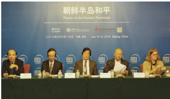
Joint panel on "Peace on the Korean Peninsula" by The Asia Foundation and Tsinghua University at the seventh World Peace Forum in Beijing.

The seventh World Peace Forum (WPF) , China's only high level nongovernmental international security forum, was held in Beijing from July 14-15, with foreign diplomats from over 40 embassies attending the opening ceremony. For the third time, The Asia Foundation's China office co-hosted a panel with Tsinghua University titled "Peace on the Korean Peninsula" that analyzed the driving force behind the recent developments on the Korean Peninsula, the challenges to denuclearization and lasting peace in the region, and the expected roles of the various parties concerned in the peace process. Prior to this year's panel, the two panels cohosted with Tsinghua University focused on Afghanistan's stability and development (2015) and the 2016 U.S. presidential election . Learn more about the Asia Foundation's programs in China .