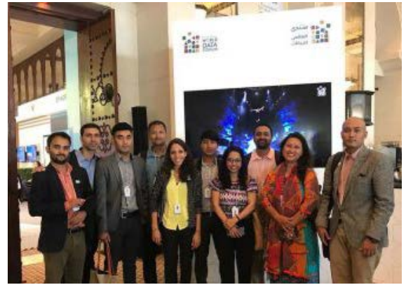
The Data for Development in Nepal team and partners at the UN World Data Forum in Dubai.

The UN World Data Forum , held in Dubai last October, emphasized the critical need for better data that is disaggregated socially and demographically to make and measure progress towards the Sustainable Development Goals (SDGs). A delegation from the Data for Development in Nepal program , an Asia Foundation partnership with the international development organization Development Initiatives , attended the three-day forum featuring the world's leading data and statistics experts from several continents. Understanding the politics behind national statistical systems, paying special attention to data on migration and gender, communicating data better to facilitate its use, complementing government statistics with alternative data sources, and addressing data privacy concerns emerged as key themes throughout the forum. Learn about the Foundation's programs in Nepal , and other programs in technology and development .