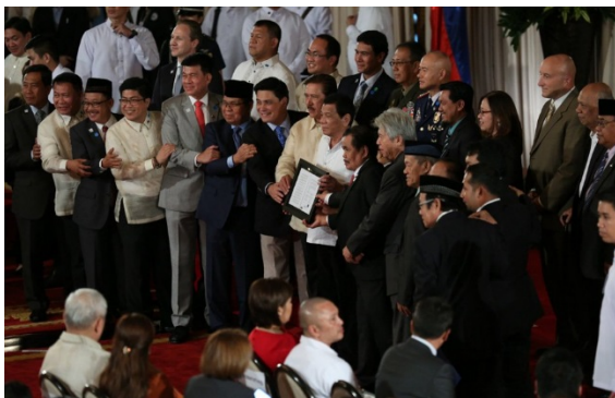
BOL signing ceremony at the Presidential Palace, August 6, 2018.

On January 21 and February 6, residents of areas affected by decades of conflict in the southern Philippines cast their votes on the Bangsamoro Organic Law (BOL) that could bring an end to decades of armed conflict and civil unrest by creating a new autonomous region for central and western parts of Mindanao: the Bangsamoro Autonomous Region in Muslim Mindanao (BARMM). Despite high tensions in the region, the dynamics are different from the last two attempts, in 1989 and 2001, to marry an executive-level peace agreement with implementing legislation. The new law has been publicly embraced by President Duterte, senior government officials including the current governor of the ARMM, the leadership of the Moro Islamic Liberation Front (MILF) and majority of the Moro National Liberation Front (MNLF). Success at the ballot will trigger a three-year transition period, with President Duterte appointing an 80-person Bangsamoro Transition Authority (BTA), led by the MILF, leading to elections in 2022. Learn more about the Foundation's programs in the Philippines , and in conflict and fragile conditions .