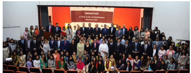
The seminar “Mediation—A New Code of Adjudication” was organized by The Asia Foundation and the Kinnaird College for Women in Lahore, Pakistan.

The Asia Foundation and the Kinnaird College for Women organized a seminar on Mediation—A New Code of Adjudication to explore the challenges, opportunities, and new developments in alternative dispute resolution (ADR) in the 21st century. ADR has been gaining policy traction in Pakistan since 2017 with the passage of several legislations in Islamabad, Punjab and Sindh. The Lahore High Court's (LHC's) strategic roadmap— Vision: 2017 —prioritizes the training of ADR practitioners, which is also conducted under The Asia Foundation's project, Mainstreaming ADR for Equitable Access to Justice in Pakistan . Read about the Foundation's programs in Pakistan and law and justice .