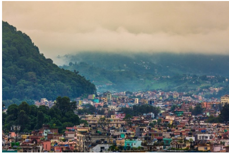
Kathmandu, capital of the Federal Democratic Republic of Nepal

The introduction of federalism and the decentralization of governance in Nepal were explicitly envisaged to improve services at the local level. Despite an abundance of political will and institutional buy-in pursuing reforms, the main objective seems elusive. To understand the ways that actors in a system of decentralized governance decide, or fail, to act, The Asia Foundation and ideas42 have been developing a new toolkit using behavioral science to study governance, particularly the knotty challenges that have hindered reform and the transition to federalism in Nepal. Preliminary insights identify the underlying psychological phenomena of status quo bias, identity, social norms and the “planning fallacy” that require further exploration. Learn more about the Foundation's programs in Nepal .