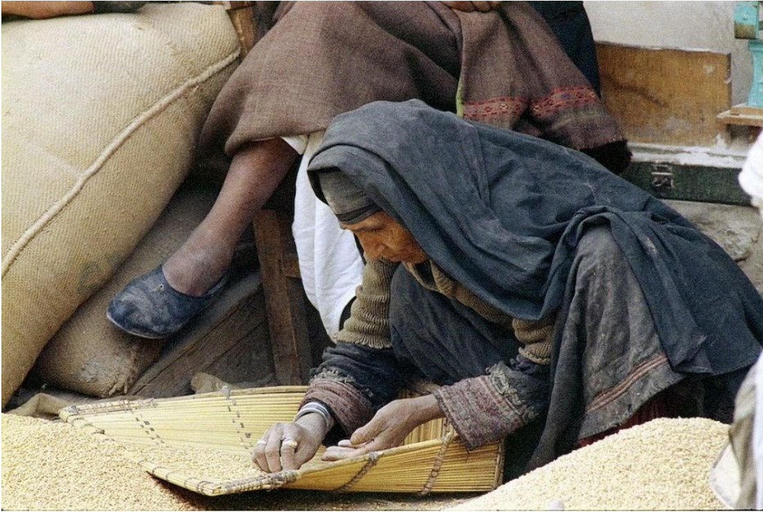
Seventy percent of rural women in Afghanistan work directly or indirectly in agriculture, but just 12 percent of all students in agricultural education are girls.

In Afghanistan, an ongoing humanitarian crisis, compounded by the impact of Covid-19, a severe drought, and an economic and banking collapse has left the population in free fall facing a cold winter of hunger. These complex factors coalesce in the agriculture sector, which is also an arena of immense gender disparity. While 70 percent of rural women work in the sector, they account for only 12 percent of students in agricultural technical and vocational training. This article of InAsia calls for developing the agricultural sector with one of Afghanistan's greatest natural resources: its people – and especially its women – to support national growth, self-reliance, and a productive and prosperous future. Learn how you can support the most vulnerable Afghan citizens and organizations through the Foundation's Afghanistan Relief Fund .