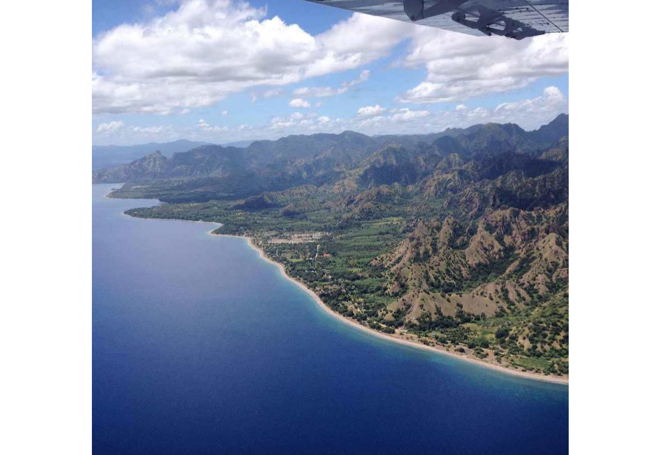
Timor-Leste's natural beauty should be a magnet for tourists but thus far this goal has been out of reach.

With only 30 cases of Covid-19, Timor-Leste is one of the few countries that has successfully contained the virus. However, the overall economic impact of the pandemic has been severe. The report Covid-19 and the Alignment of Timor-Leste's Aviation and Tourism Strategies advocates for regional travel agreements with countries that have similarly contained the virus and calls for strategies to safely resume tourism and initiate a much-needed boost to the economy.