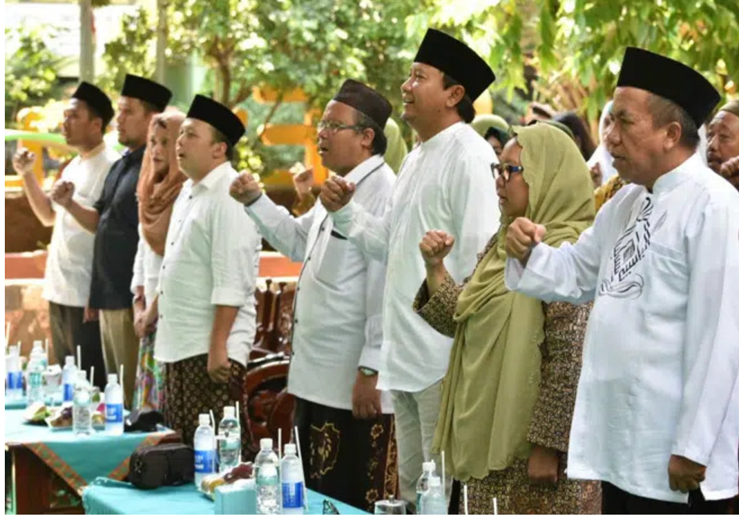
Participants speaking out against sectarian narratives and identity politics.

Myanmar's rollout into military rule is a recent and catastrophic example of the trend of democratic decline throughout Asia. In this context, The Foundation is working to foster democratic resilience through Reclaiming Civic Space to Promote Democratic Resilience, a pilot program in Indonesia. The initiative focuses on espousing local political participation to empower citizens to shape a political agenda that is centered on shared needs and interests to ward off sectarian narratives and polarization.