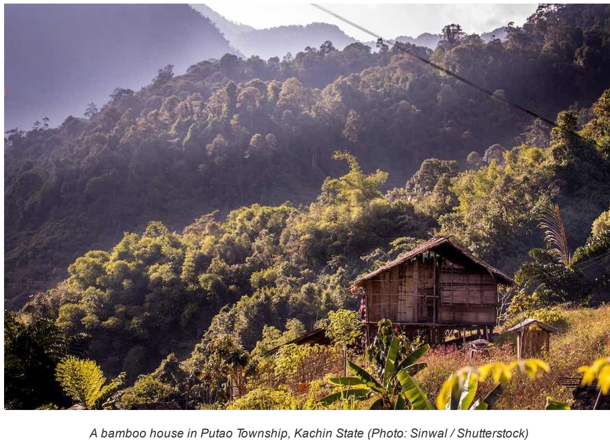
A bamboo house in Putao Township, Kachin State