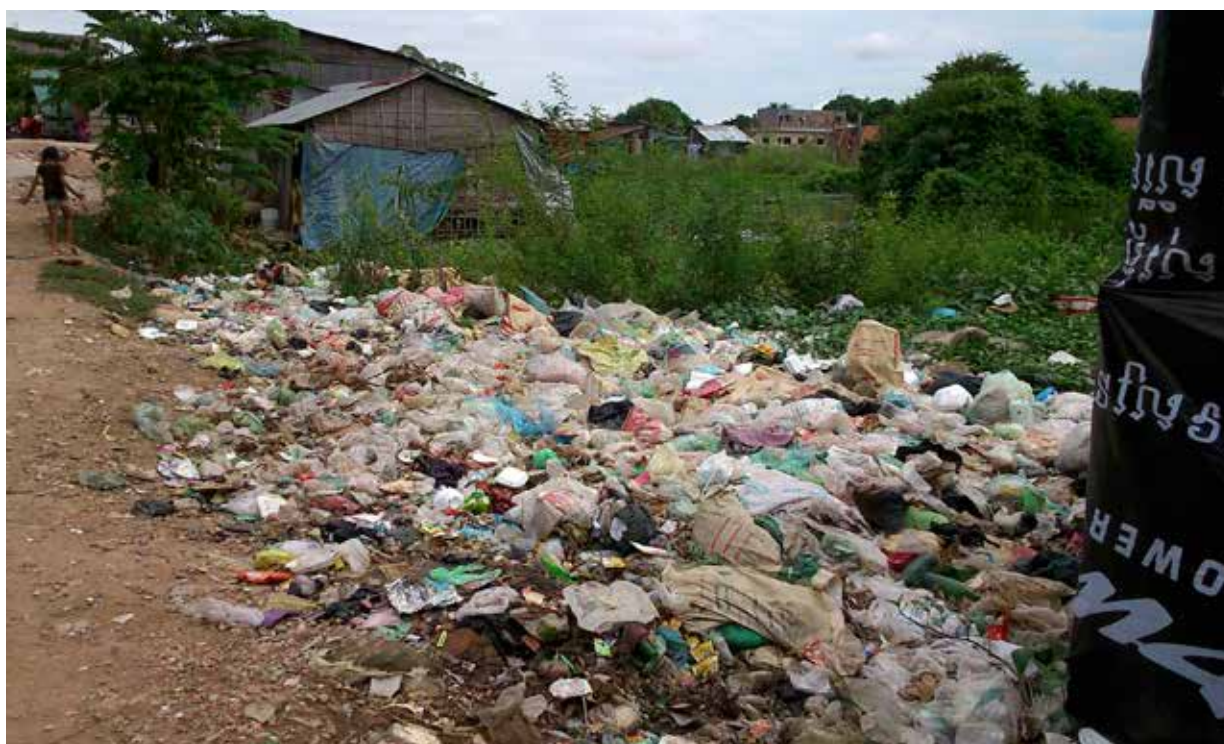
Waste piles in Chbar Ampov before the October 2014 pilot (Lisa Denney, 2014)

The cart pushers—all female—were mostly mothers who had seen what the poor standards of sanitation had done to the health of their children. Both they and community leaders reported fewer children getting sick since the project began. The cart pushers worked in teams of two, collecting waste from their neighborhoods twice a day. In practice, it was difficult and took some time to reach agreement on the location of the central dumpsters. This meant that in two of the three communities involved, the cart pushers took collected waste to the main roads where CINTRI collects waste—however, the collection trucks often did not come on time due to traffic jams, and so they dumped the waste in an area where CINTRI would collect it.