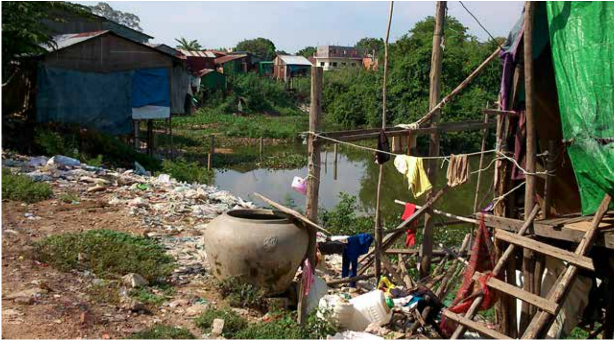
Waste piles in Chbar Ampov during pilot in April 2015

By the end of the pilot, however, all three communities had designated dumping sites. UPWD engaged with CINTRI, who increased collection in the Khan, and with the Khan authorities who were able to apply additional pressure on CINTRI. Through these relationships, UPWD successfully advocated for 10 families in the Khan to have their long-standing waste collection fee debts to CINTRI written off on the grounds that service had not been provided. The outer Khan pilot project was much more focused on bottom-up solutions to waste management than the rest of the reform strategy, although it still fit within the overall goal of making Phnom Penh cleaner.