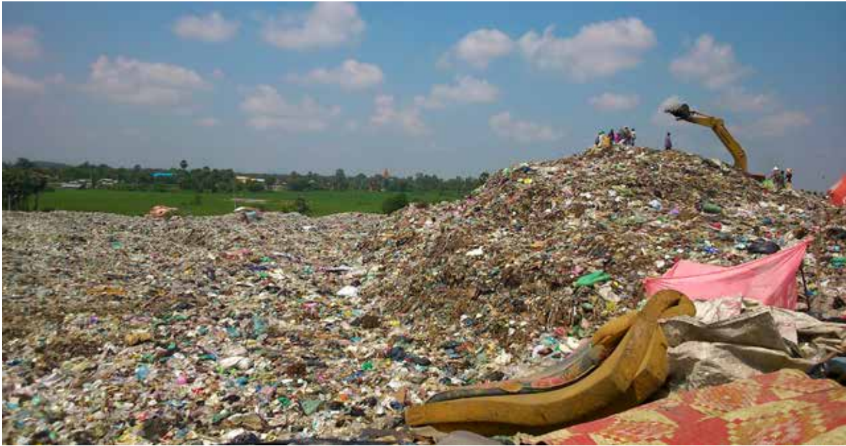
Phase 1 of Dangkao landfill nearing capacity in October 2014

problems have not remained static throughout the life of programming. The ‘problem’ is introduced here for the benefit of the reader, but it is important to note that the team had neither as full an understanding or as clear a focus at the outset of its work, as will become apparent in the sections to follow.