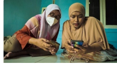
From Crisis to Opportunity: Bridging ASEAN's Digital Skill Gap