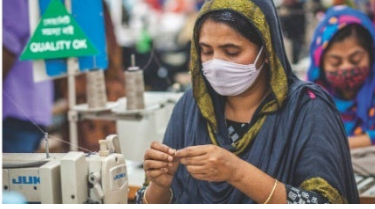
From Safety to Skills: Preparing Bangladesh Garment Workers for a Future of Automation