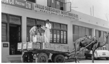
From Camels to Clicks: Expanding Access to Knowledge