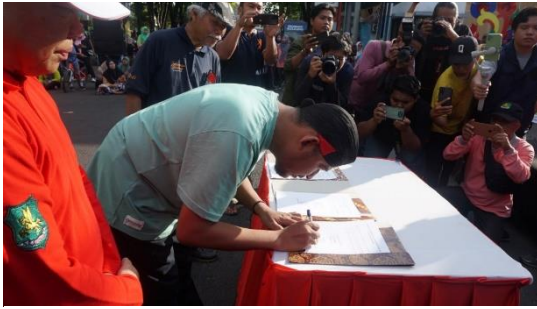
Picture 11 The Regent of Sumenep signed his commitment to reduce CEFM through SADEL CEPAK, August 6, 2023.

USAID ERAT also supported the LG of Luwu Utara in issuing a perbup on village fund allocations ( alokasi dana desa , ADD) that promotes LG-village collaboration in achieving the sustainable development goals (SDGs) and includes performance-based fiscal incentives for good-performing villages. USAID ERAT also supported the LG of Sambas in improving the MNCH services through collaboration with villages, including through provision of fiscal-based incentives. These two initiatives are further discussed in section 3.3.6 below. Another LG-village collaboration is developed in Lamongan, Blitar, and Sumenep , through an innovation named SADEL CEPAK ( Desa