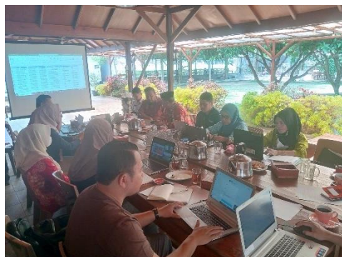
Picture 1. Poverty data synchronization process in Mandailing Natal, NS, July 7, 2023

LGs in ENT , EJ , NS , and WK in improving compliance with the CG's instructions on these documents through training and TAs.