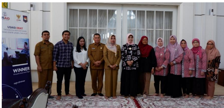
Picture 16. Berikan Protein held an introductory meeting with the Acting Governor of North Sumatra who also serves as the Chair of the PKK Mobilization Team to introduce their business model and products aimed at addressing stunting.

USAID ERAT recognizes the pivotal role of private sector engagement in improving of public service delivery. Private companies possess the capacity to infuse innovation, provide essential resources, enforce accountability, and stimulate healthy competition. In line with this perspective, USAID ERAT supported the Ministry of Administrative and Bureaucracy Reform ( Kementerian Pendayagunaan Aparatur Negara dan Reformasi Birokrasi, KEMENPAN-RB ) to hold Social Entrepreneurship for the