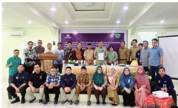
Picture 13. Participants of workshop to formulate government and non-governmental actors' intervention plans for accelerating extreme poverty reduction in Barru (August 8, 2023).

Barru, a district located around 102 km or 1.5 hours ground transportation from Kota Makassar, South Sulawesi Province, has a population of around 186,000 people. Extreme poverty is one of main issue in Barru, with Target Data for Extreme Poverty Eradication Acceleration ( Pensasaran Percepatan Penghapusan Kemiskinan Ekstrem , P3KE) issued by the Coordinating Ministry for Human Development and Culture (KEMENKO PMK) initially indicated that around 54,500 of the people there were living in extreme poverty. Subsequent verification and validation conducted by the Barru Government with the support from USAID ERAT have corrected this figure to 37,508 individuals.