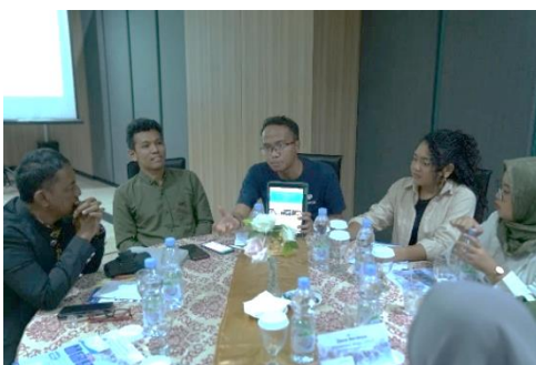
Picture 10. One of WiNNER's finalists from West Kalimantan presented his innovation to the related stakeholders during the business matching event, September 5, 2023.