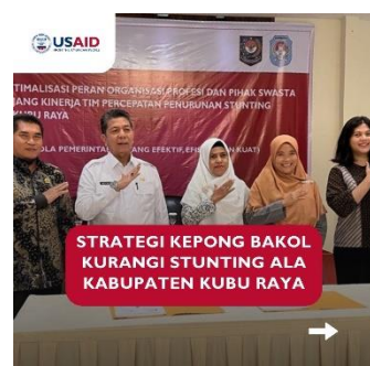
Picture 3. Screenshot of social media engagement for "Kepong Bakol Strategy from Kubu Raya to Reduce Stunting" content.

As indicated in its strategic communications plan, USAID ERAT plans to convey messages to improve local governance and public service delivery through its website and social media channels. The @usaid.erat Instagram account has garnered 978 followers and reached 10,746 unique accounts since its creation a year ago. This account is used as a platform to share information about USAID ERAT's activities, share knowledge about public services to the community, and as means of communication to increase public awareness of public policies. Throughout FY 2023, @usaid.erat posted 102 contents, including 50 collaborative posts with @usaidindonesia , @tonsofidea , and @angin.indonesia . Posts have been made covering topics such as social inclusion, idea-thons, returning out-of-school children movements, stunting, universal healthcare access, CEFM, PSE for public service, and youth engagement.