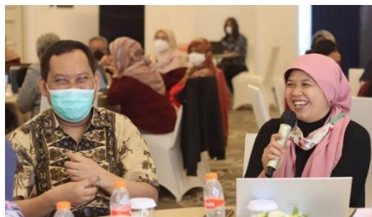
Picture 5. Participants of the workshop on inclusive public services with KEMENPAN-RB, November 2, 2022.