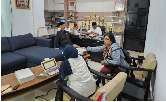
Picture 14. Meeting between Barru's Bappelitbangda and BAZNAS to discuss the assistance BAZNAS can give to help extreme poverty eradication in Barru, facilitated by USAID ERAT (August 9, 2023).

data to provide free electricity connections for 495 low-income households. To put this collaboration into action, the LG of Barru will hold discussion of the Cooperation Agreement (PKS) with BAZNAS and PLN on October 10, 2023.