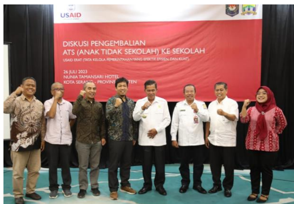
Picture 12. USAID ERAT Banten's team posing with Kota Serang's Mayor who supports "Aje Kendor Sekolah" (Don't Stop Schooling) program.

Education is not only a fundamental human right but also a cornerstone of progress and development. It plays a vital role in personal development, economic prosperity, social cohesion, and the overall well-being of individuals and societies. It is also a key component of the Human Development Index, which has the mean years of schooling and expected years of schooling as part of its indicators. Based on these principles, USAID ERAT has been actively supporting the Government of Kota Serang in elevating its Human Development Index, with a particular focus on reintegrating out-of-school children into the educational system.