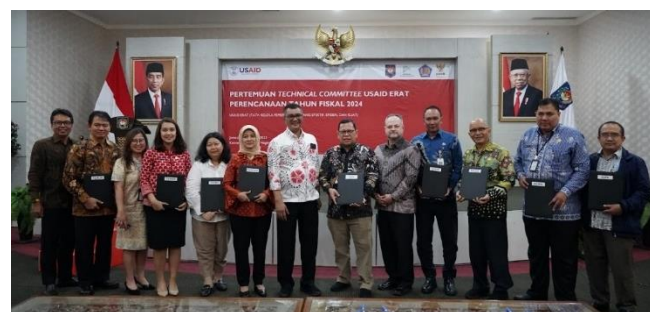
Picture 1. Representatives of USAID Indonesia, USAID ERAT, EA, and IAs after the signing of FY 2024 work plan documents, September 8, 2023.

Prior to the Technical Committee meeting, PUSPEN of MOHA, the IA responsible for promoting access to information and complaint handling management at the subnational level (see section 3.1.1, 3.2.4, and 3.3.3 below), suddenly submitted a letter to FASKER and USAID dated September 7, 2023 indicating its resignation as an IA of USAID ERAT. In consultation with USAID and FASKER, the USAID ERAT Team proposed to YANLIK of KEMENPAN-RB to take over the activities promoting improvement of the complaint handling management at the subnational level. Within a very short period, YANLIK agreed to absorb these activities that were supposed to be implemented by PUSPEN in FY 2024. Meanwhile, USAID ERAT will seek a new IA to implement the activities to promote access to information at the subnational level in FY 2024.