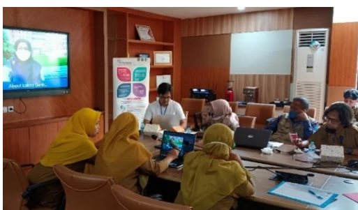
Picture 8. USAID ERAT facilitated peer-to-peer learning from Kota Cilegon Health Office to Kota Tangerang Health Office to learn more about their innovation in improving children nutrition, August 8, 2023.