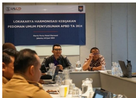
Picture 6. Representative from KEUDA and USAID ERAT leading the discussion in formulating the national guidelines for sub-national budget allocation, June 8, 2023.

USAID ERAT supported KEUDA in improving the quality of permendagri governing the formulation of subnational budgets ( anggaran pendapatan dan belanja daerah , APBDs) for FY 2024 through an inter-ministerial forum held in June 2023. The forum facilitated KEUDA to consult the draft regulation with CG’s technical ministries/agencies and other DGs within MOHA to ensure alignment of FY 2024 APBD with CG policies, particularly in public service provision. The opportunity was also used by USAID ERAT to advocate the local governance and public service issues it promotes, including digital transformation, financial assistance ( bankeu ),