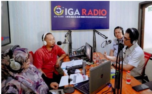
Picture 9. USAID ERAT collaborating with local radio and the LG of Barru to promote the use of SP4N-LAPORI, September 20, 2023

Improving access to information and public participation is a basic governance aspect that has not been widely proposed by the PGs and LGs to be supported by USAID ERAT. After establishing working relationships with PUSPEN in Q1 of FY 2023, USAID ERAT supported them to host a workshop on improving access to information and complaint handling mechanisms in Surabaya in February 2023. PUSPEN also engaged YANLIK of KEMENPAN-RB, the Ministry of KOMINFO, the Ombudsman, Central Information Commission, and relevant CSOs in the implementation of the workshop, in which by all six PGs and 30 LGs supported by the Activity participated. The workshop discussed challenges and opportunities and developed detailed work plans in improving access to information and complaint handling mechanisms. The workshop has successfully encouraged ERAT-supported PGs and LGs to work intensively and collaboratively with PUSPEN and the USAID ERAT Team in promoting these two initiatives.