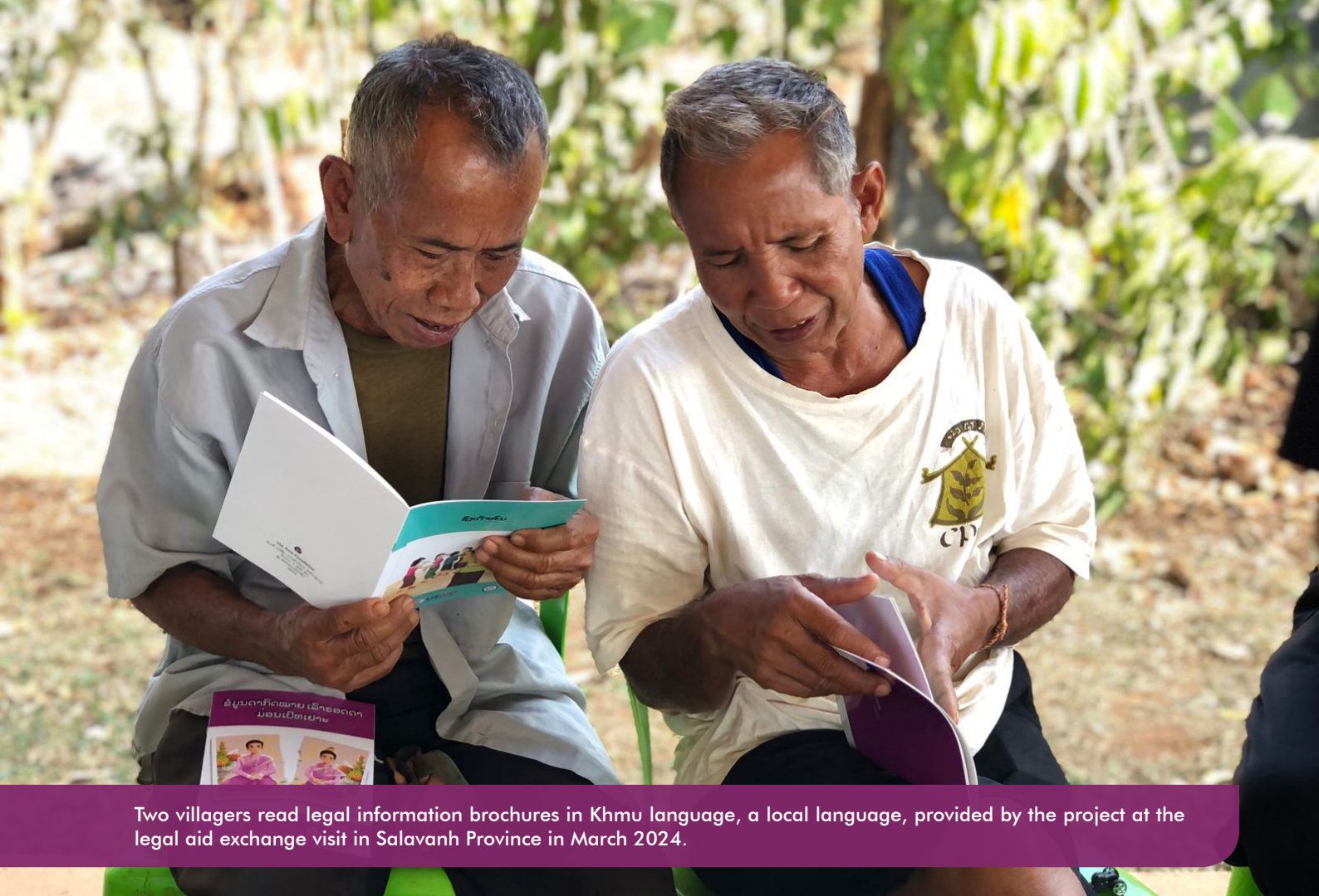
Two villagers read legal information brochures in Khmu language, a local language, provided by the project at the legal aid exchange visit in Salavanh Province in March 2024.