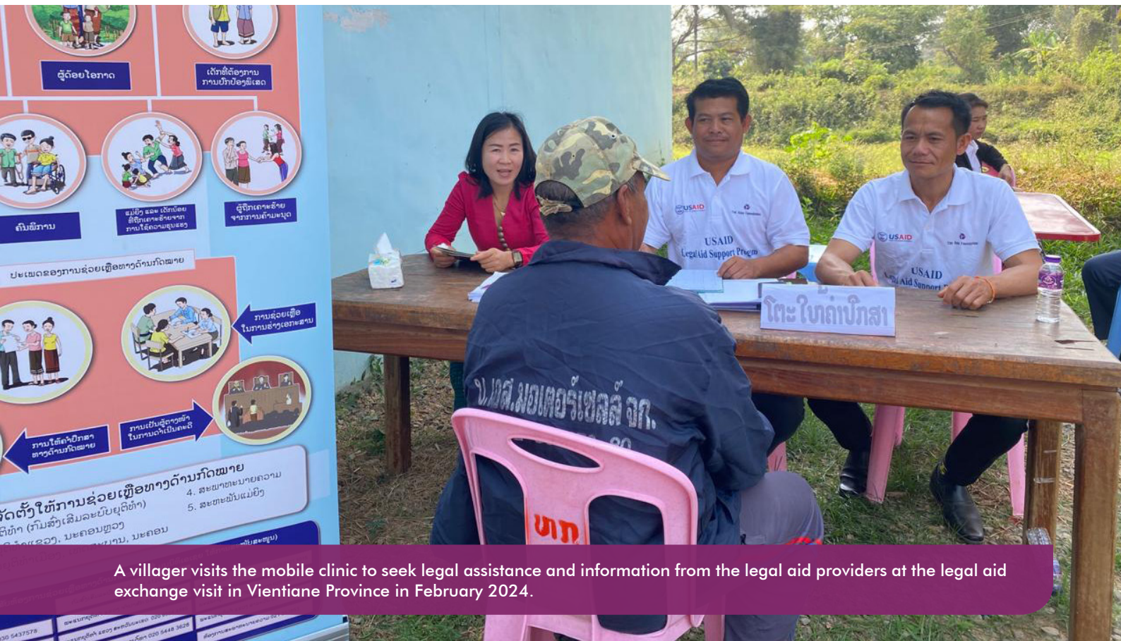
A villager visits the mobile clinic to seek legal assistance and information from the legal aid providers at the legal aid exchange visit in Vientiane Province in February 2024.

Finally, TAF has had difficulty measuring long-term impacts. Data collection across MOJ systems is weak, and—like many others in the development sector—TAF has historically underinvested in monitoring and evaluation. 21 While TAF assesses training activities through pre- and post-tests, there has been little follow-up to capture institutional or behavioral change over time. More participatory approaches—such as stories of change or client feedback mechanisms—would help capture the lived experience of justice users and strengthen program learning. 22