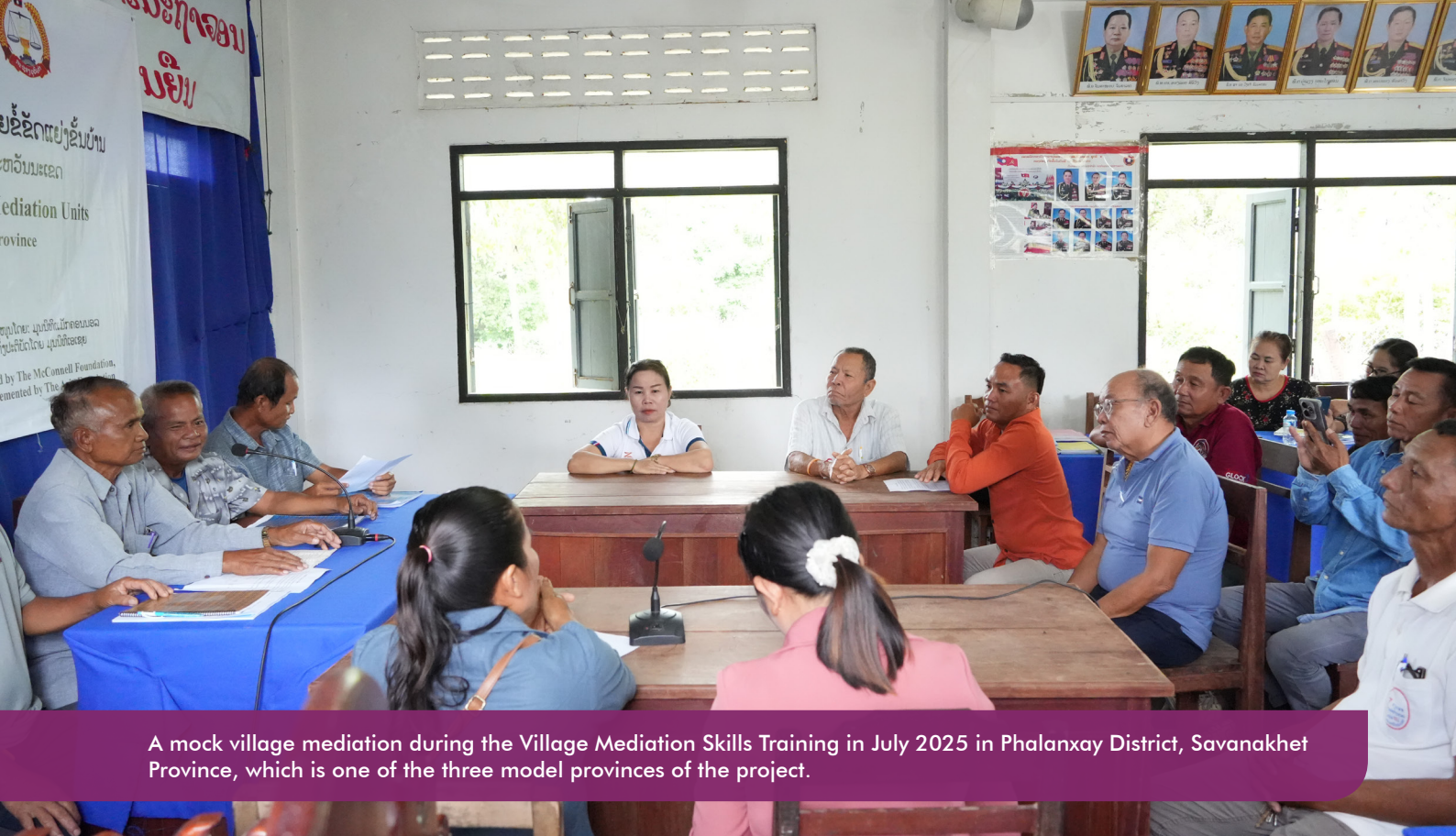
A mock village mediation during the Village Mediation Skills Training in July 2025 in Phalanxay District, Savanakheth Province, which is one of the three model provinces of the project.

The ILS now develops these products independently, with growing demand from the National Assembly’s President and Standing Committee. Parliamentarians report that the notes have improved debates and contributed to more substantive discussions on draft laws, though it remains difficult to quantify direct impacts on decision-making. 15